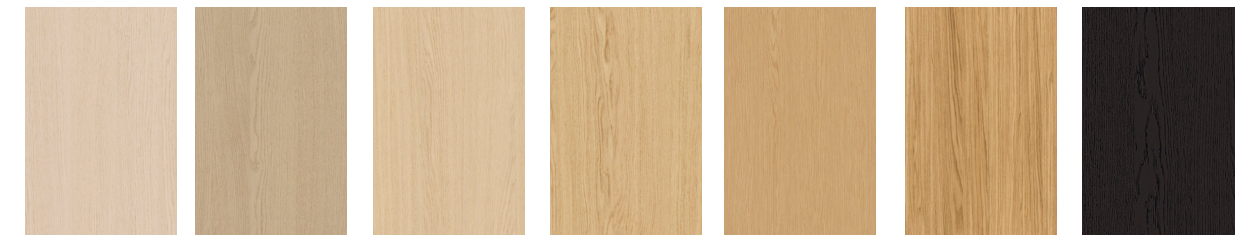
Bondi Oak Desert Oak Milk Oak Ivory Oak Ivory Infinite Oak Natural Oak Raven Oak